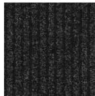
AUCKLAND 2055/- Black