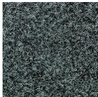
2081/- Dk Grey